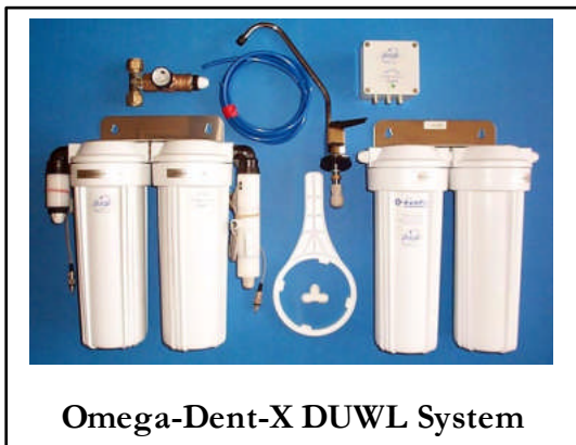
Omega-Dent-X DUWL System