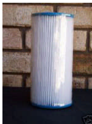
PN46 - Pleated Sediment Included