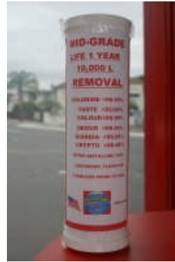
PN84/cto - Carbon Included