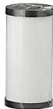
PN102/CTO - Carbon Included