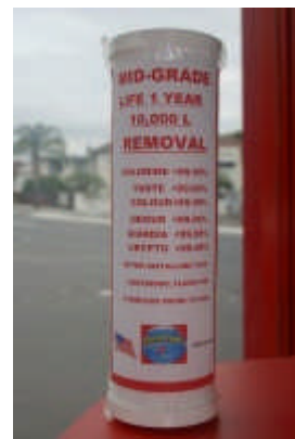
PN84/cto - Carbon Included